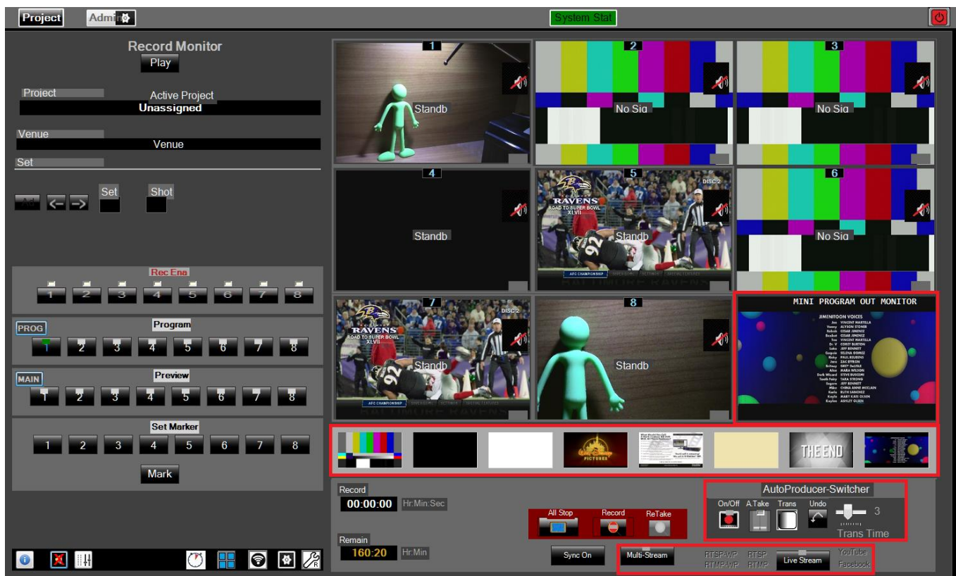
V-Station Studio8 Record Panel With Highlighted Newest Enhancements