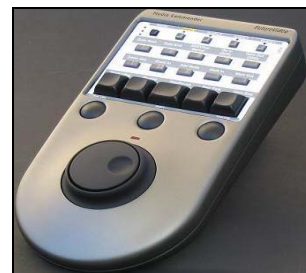
MC-20PRO Tactile Control Surface (included)

FutureVideo’s MC-20PRO Multi-function Jog/Shuttle Control Surface provides precise frame-by-frame review and optimal system control for Multi-View 2.0 users. In addition, on-screen playback control buttons are provided that can be accessed with a mouse, or by keyboard short-cut keys. The controls provide for rewinding, fast forwarding to the beginning/ending of a video clip, play/pause, seeking to trim points and event marks, stepping forward/reverse frame by frame, and loop playback.