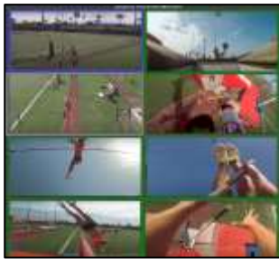
Multi-View Monitor Single Screen Show

Play back multiple videos taken from different angles or at different times—displaying up to 8 different views on a single screen or even on multiple monitors in different sizes and positions.