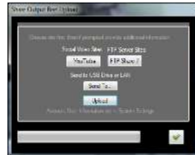
Share Videos Upload Panel

Multi-View HD Pro 2 software enables you to deliver your edited videos directly to YouTube, sent to a FTP server, or send to a USB drive or LAN via its built-in Share uploader. Multi-View HD Pro 2 edited videos can be encoded in a variety of formats (see Note below).