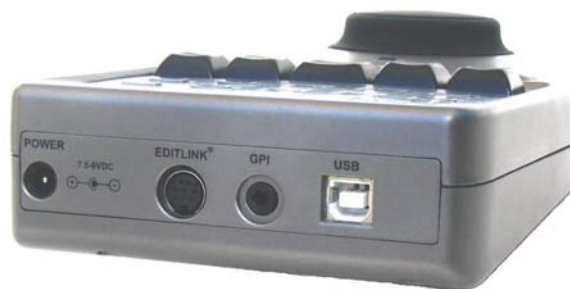
MC-20 Rear Panel

A general purpose interface (GPI) port has been conveniently provided for controlling other equipment in the studio or the field.